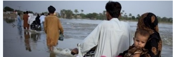
UNICEF PAK 2010