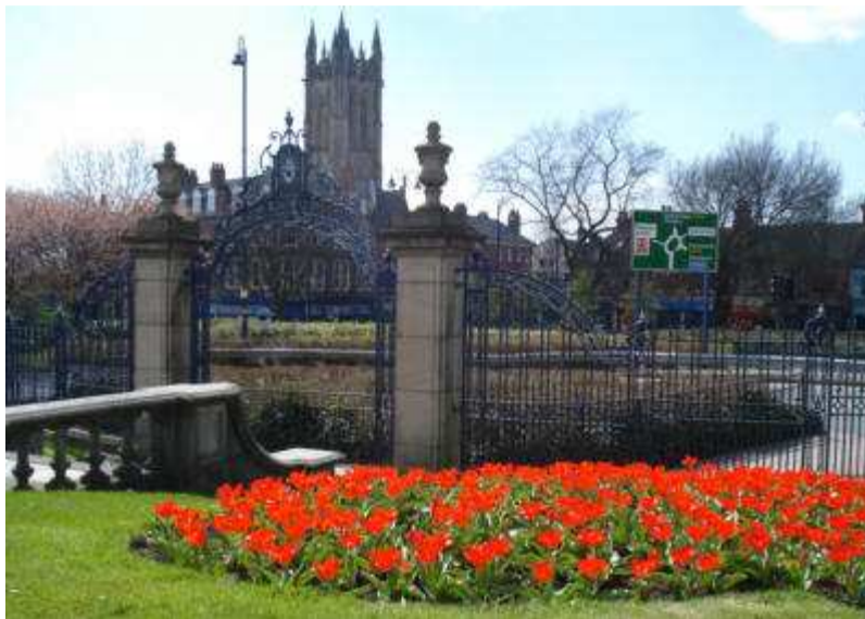
These photographs were taken in the spring of 2008.

Ashton Parish Church, St Michael and All Angels, Diocese of Manchester.