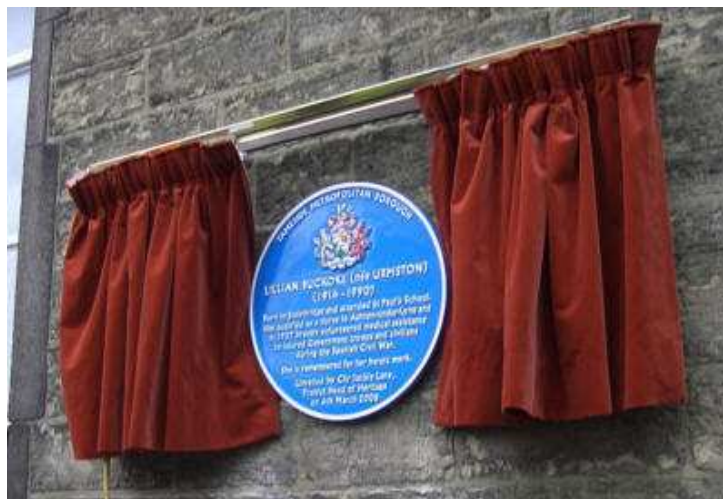
The Blue Plaque.

Lillian Urmston as she was known before her marriage was born in Stalybridge in 1914 and she died in 1990.