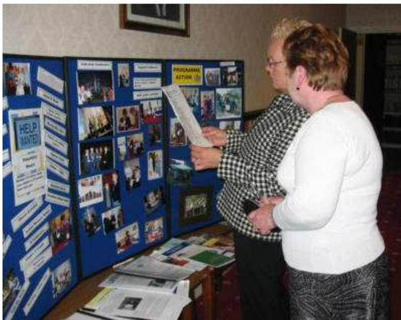
Visitors looking at Club information