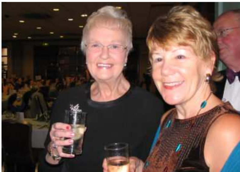
Guests before the meal