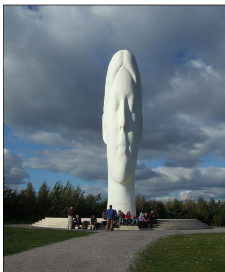
SI St Helens dared to dream.

"The details don't all matter at this stage but each meeting was analysed and organised accordingly."