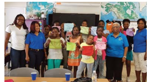
Turks and Caicos