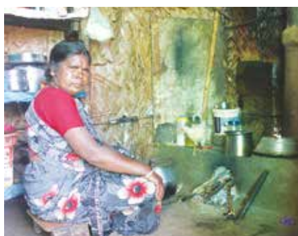
SI Kodaikanal's Smokeless Stoves 6 AUGUST 2017

SI South Kolkata raised awareness amongst the women and children in a slum area of the benefits of keeping the neighbourhood clean. They encouraged