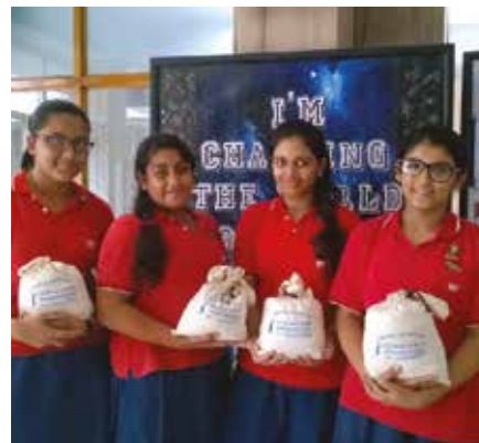
SI Calcutta took the Fistful of Grain project to six schools where they asked the girls to put aside a fistful of rice to help to feed children in orphanages.

-14 years are asked to put aside a fistful of grain during mealtimes for a period of about two weeks.