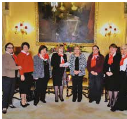
SI Malta collected money from delegates at last year's SIGBI Conference to support university research into women's health issues, such as breast cancer.

services including money advice, helping to break the cycle of poverty.