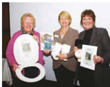
SI Stafford's Flush Away Poverty project