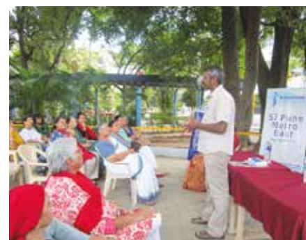
SI Madurai's Forestation project