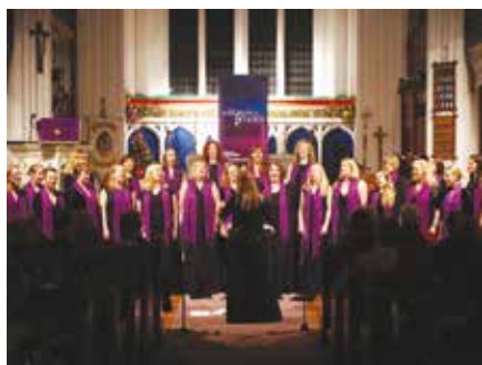
Bristol Military Wives Choir

Just like Soroptimists, Members of the Military Wives Choirs build unbreakable bonds and also break down barriers. By coming together to sing, each choir creates a valuable support network for women in the military community.