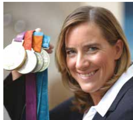
Dame Katherine Grainger