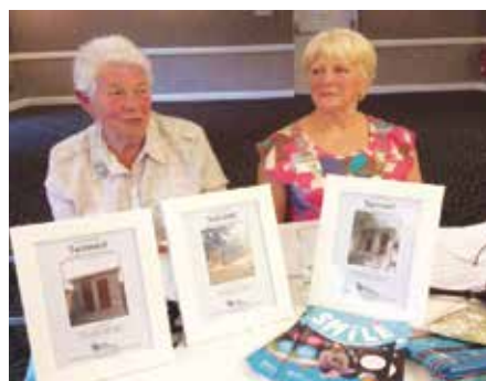
SI Widnes: Toilet Twinning project

The Club believes that the project is unique as it focuses on more than one Soroptimist focus area, namely Environmental Sustainability, Economic Empowerment as well improvement of mental health of women prisoners.