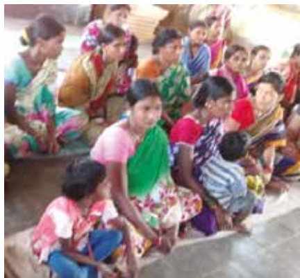
SI Pune Metro East marked World Health Day and Ovarian Cancer month with an interactive session on depression and ovarian cancer.

Swindon, Canterbury and Falkirk have all held events to raise awareness about Ovarian Cancer and to raise money in aid of Target Ovarian Cancer.