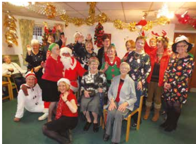
SI Dewsbury and Father Christmas held a Christmas party for the residents at Tentercroft Court, complete with The 12 days of Christmas panto-style!