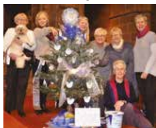
SI Crosby supplied a beautiful Christmas tree at St. Faith's Church, Waterloo. Members went along to dress the tree on 2nd December. Their theme was "Soroptimists, who we are and what we do." The tree, dressed in Soroptimist colours raised funds for charities.