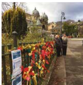
SI Buxton Members joined Buxton Town Team to brighten up their town with Christmas bows, to make the festive season special for everyone, before meeting at the Cavendish Golf Club for their Christmas Dinner. Greetings from Hamburg and Stockport Soroptimists were read out, as well as "thank you's" from Charities helped by the organisation.