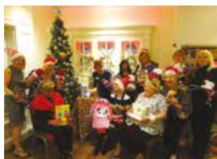
SI Cannock supported the Pathway Project by providing Christmas gifts such as clothing, beauty packs, toys and games for women and children spending Christmas in the refuge run by the Pathway Project for victims of domestic violence. The donated gifts filled two cars and the gifts, together with wrapping paper and all the trimmings, were gratefully accepted by staff from Pathway. Cannock & District Soroptimists also had their usual stall at Norton Canes on Sunday 3rd December when the Community Centre held their annual Winter Fair. Club members sold reindeer food – helping children to fill bags with food for Rudolph and his friends - as well as showcasing issues and organisations supported by Soroptimist International.