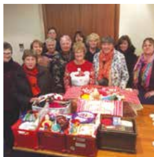
SI Medway Towns collected Christmas food, crackers, gifts, toys and toiletries to bring a little festive cheer to the women and children who are far from home and living in Medway's women's refuges. Women who have been victims of domestic abuse are offered sanctuary in women's refuges as far from their homes as possible and they arrive, often with their children, with nothing but the clothes on their backs. Christmas, therefore, could be rather a bleak occasion. They are offered protection and care in the refuges but with funding being reduced all the time, some festive food, a few treats and presents to make Christmas special, are very welcome.