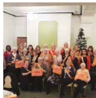
SI Wolverhampton showed their support for the 'Orange Wolverhampton' campaign by turning their Christmas festivities orange at their December dinner meeting. They all wore orange sashes, ribbons or clothing and even their Christmas gifts followed this theme as they all received a chocolate orange. 'Orange Wolverhampton' is a local awareness-raising campaign that is part of the United Nations' international 16 Days of Action to end violence against women and girls. Club members also wore orange ribbons during the 16 days which ran from 25th November to 10th December, 2017 which is Human Rights Day.