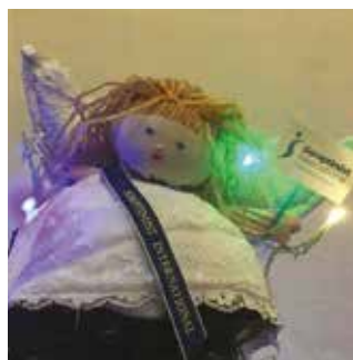
SI Chelmsford collected over 1000 bras for The Purple Teardrop Campaign, so when they submitted a Christmas Tree entry at the Writtle Christmas Tree Festival, the tree had to be decorated with 'brables' and a beautiful two bra angel called Brabara! This gave an opportunity to raise awareness of The Purple Teardrop Campaign and Members also had fun making the brables!