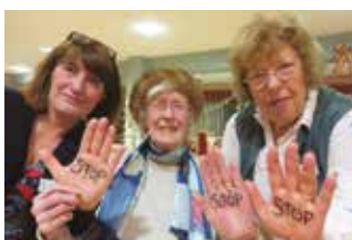
SI Darlington & District (above) welcomed two new members at their December meeting, making a total of five during 2017.