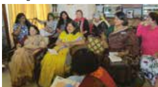
SI Pune Metro East takes membership issues very seriously. Since its Charter in 2010 membership, has never dropped below 30. The Club prides itself with winning nominations and awards each year, which, they say, is possible only through

their committed and sustained membership.