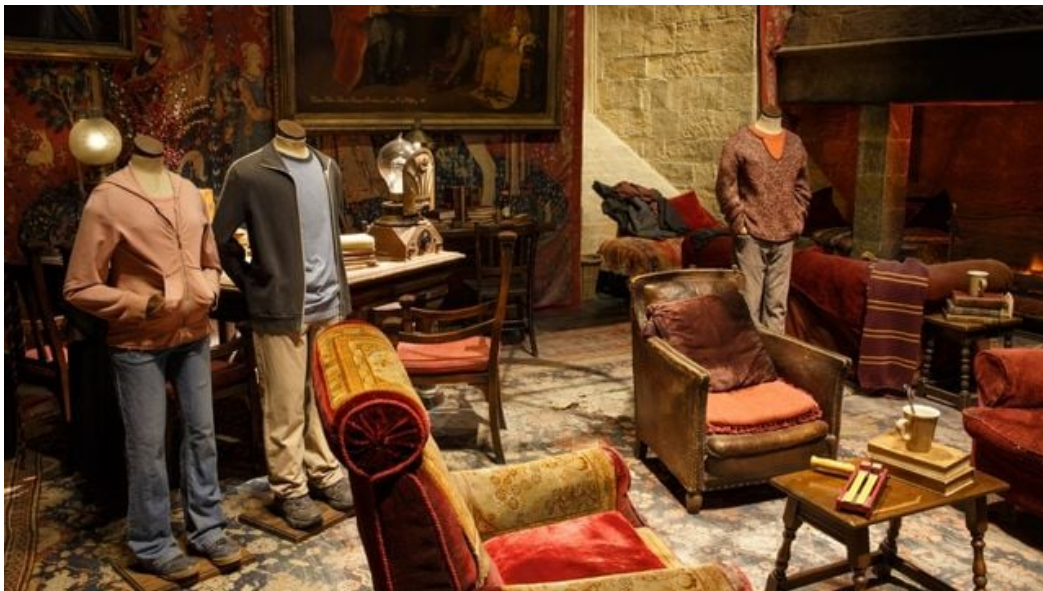
Harry Potter Publishing Rights © JKR.