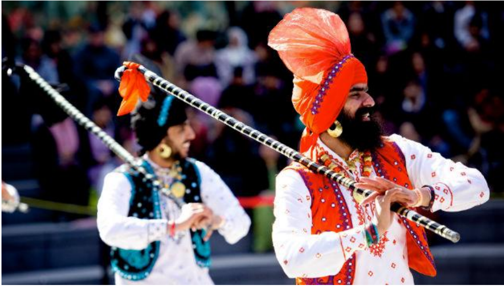
Vaisakhi Festival in Trafalgar Square.