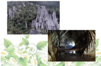
SISWP Conference of Clubs 2014

WORLD'S LARGEST CAVE SYSTEM, THE MULU CAVES AND THE RICH TRADITIONAL CULTURES OF THE MANY TRIBES OF SARAWAK, YOU WILL BE INTRIGUED.