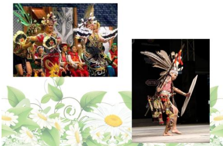
SISWP Conference of Clubs 2014

WORLD'S LARGEST CAVE SYSTEM, THE MULU CAVES AND THE RICH TRADITIONAL CULTURES OF THE MANY TRIBES OF SARAWAK, YOU WILL BE INTRIGUED.