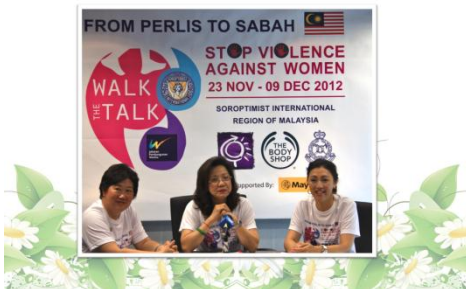
SI Region of Malaysia Walk The Talk

WE ARE ALSO SEEKING THE SUPPORT OF THE MEDIA TO CREATE WIDE PUBLICITY ON THE WALK AND THE CAUSE, THROUGH NEWSPAPERS, RADIO AND TV TALK SHOWS. THE USE OF THE SOCIAL MEDIA, BEFORE AND DURING THE EVENT WILL HELP TO RALLY MEMBERS OF THE PUBLIC TO THE CAUSE AND CREATE EVEN WIDER PUBLICITY FOR SWP.