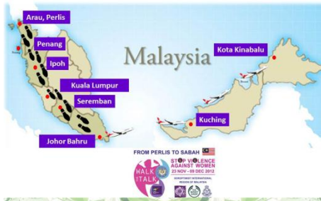
SIROM Walk The Talk

THE WTT EVENT INVOLVES 3 SOROPTIMIST MEMBERS FROM SI KOTA KINABALU FROM SABAH