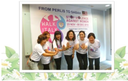
SI Region of Malaysia Walk The Talk

THE WTT EVENT INVOLVES 3 SOROPTIMIST MEMBERS FROM SI KOTA KINABALU FROM SABAH