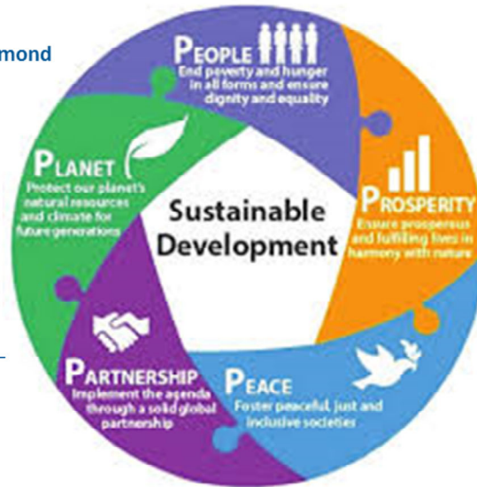
APD People - Yvonne Gibbon