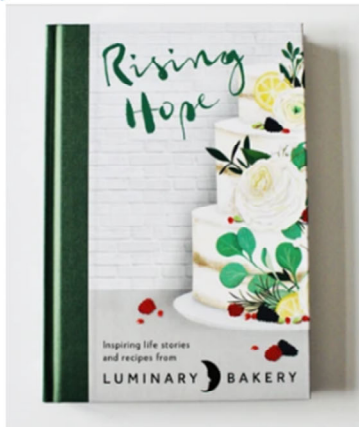
RISING HOPE COOKBOOK £20