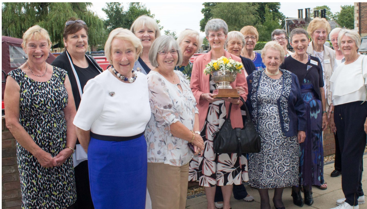
Presentation of the Regional Rosebowl 2018

The Coronavirus pandemic of 2020 has impacted every part of our daily lives and being a Soroptimist club member is no exception. Our usual meeting place, Blackpool North Shore Golf Club, closed the venue in March 2020 at the start of lockdown so in true Soroptimist spirit we arranged Zoom Business and Executive meetings and social events for members until the easing of lockdown restrictions. Members kept busy and collected toys, books and games for local schools to distribute to children and their families struggling during lockdown; knitted squares to make in to blankets for the Fistula Hospital in Ethiopia. A member was involved in the local organisation of making scrubs for the hospital and others helped to make masks, sold in aid of the hospice. The club's communications team published and edited a monthly newsletter, Seaside News, to keep members who are not on-line up to date and informed (see sample below) and also acts as publicity for potential new members.