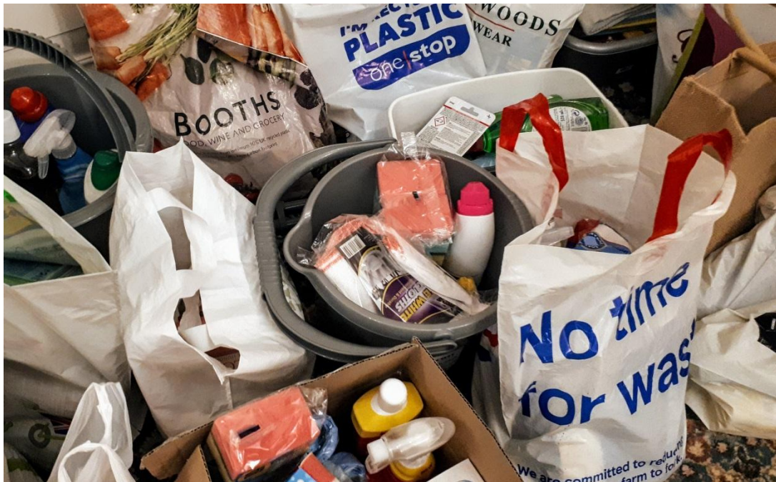
Collection of household cleaning items for women setting up their own home following a stay in the Refuge

the club holds one share in the Housing Company. Our Service to the community was honoured and recognised when the club received The Local Hero's Award in 2019; the award was presented at an evening event in the Tower Ballroom, Blackpool.