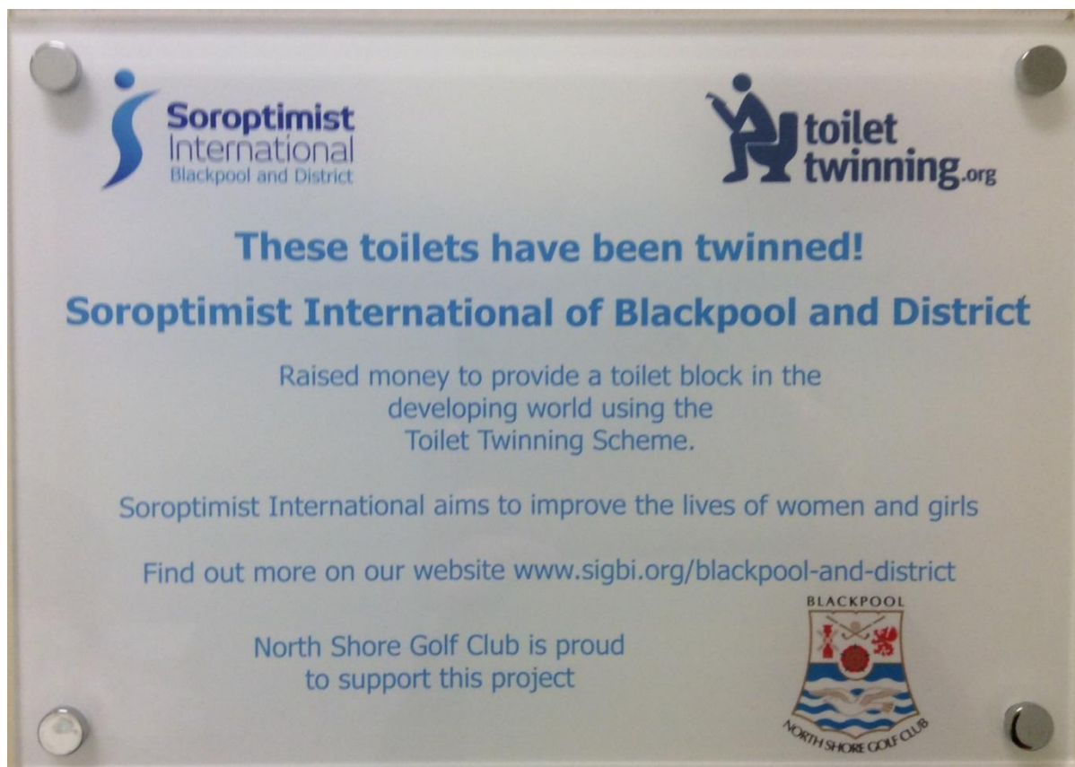
Toilet Twinning Plaque

Recently the charities Blackpool Carers, Red Box Project, Plan International and Toilet Twinning have benefitted from members' support. The Toilet Twinning project also involved placing plaques in 8 high profile venues locally. The plaques raised awareness not only of the Toilet Twinning Scheme but also of the work of Soroptimist International.