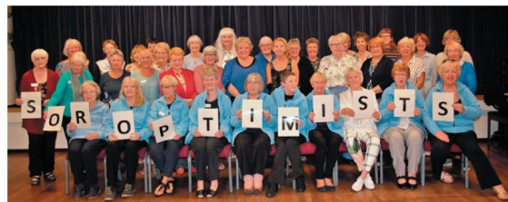
All participants of the Regional Rosebowl 2019