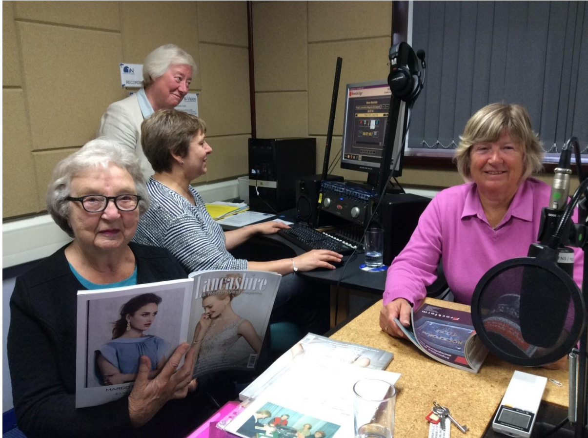
Members recording the Talking Newspaper

Members have given Service to many local organisations and charities throughout its 60 years. The longest of these is Talking News, a recorded reading service for the local Blind Society, now known as N-Vision. A team of 4 readers and a technician has made regular recordings (now monthly) since the Talking News project began in 1977, a total of 44 years of continuous service. Members also purchased a new recording table and microphones for Talking News in 1988. The club provided a team for the local Child Contact Centre Service to enable a separated parent to meet their children in a neutral and safe environment. This service was given from 1998 to the closure of the centre in 2015.