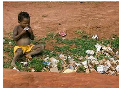
on. transforming lives