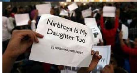
Women inspiring action, transforming lives

That was 2012. The same year a horrific gang rape of a young girl, on a bus in the capital New Delhi shook the nation and galvanized marches, protest sit -out down, candlelight marches, strikes. The victim died and that added to the anger and upheaval with women's groups demanding death for the rapists.