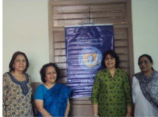
Women inspiring action, transforming lives

At an urban slum we managed to have an audience of women and girls that were responsive. – explaining to them the gender stereotype and encouraging them to change their attitudes towards girls being any less than the boys in their families. Despite economic growth gender disparities persist.