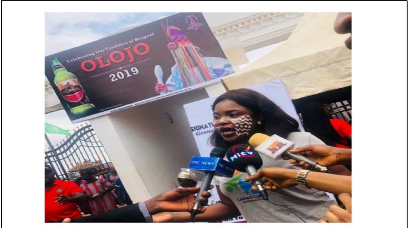
You are going to become friends with 6 amazing women from Kenya, Nigeria, Sierra Leone, Gambia and Somalia who use media to break the silence on this practice.