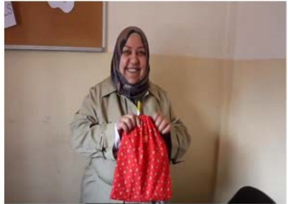
Sanitation in Refugee Camps