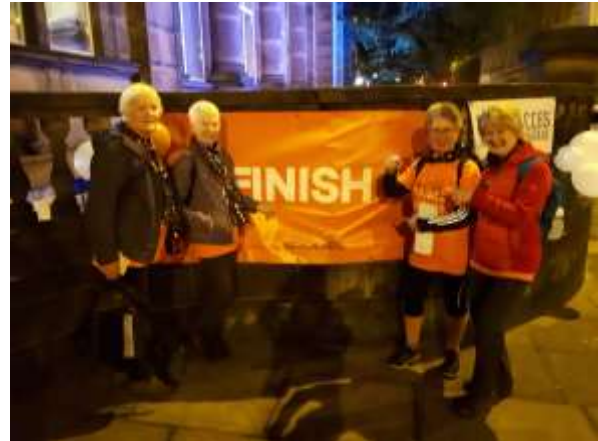
Above and right: Members of a singing group in Dunfermline who also enjoy walking.