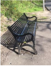
An Anti-Vandal KC Bench Seat - a welcome sight for weary legs!

When Clive and I started walking on the cycle ways a few years ago, there were very few benches (like the one pictured) on the paths. I began to think it would be nice for SIE, or those of us flush enough to