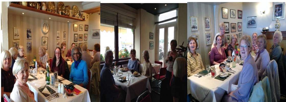
Members' visit to Largs