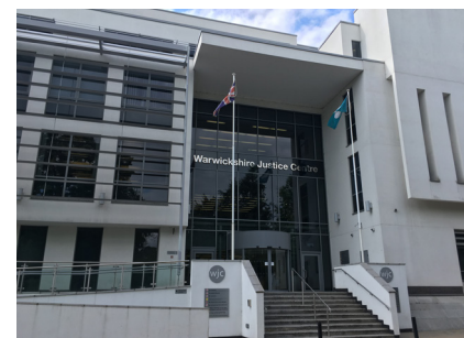
Warwickshire Justice Centre