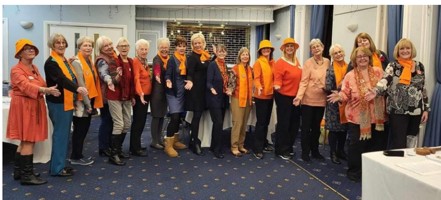
Club members wore Orange to mark 16 Days of Activism