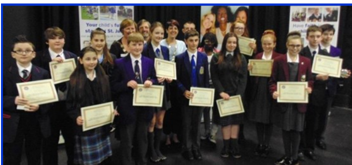
The contestants and judges