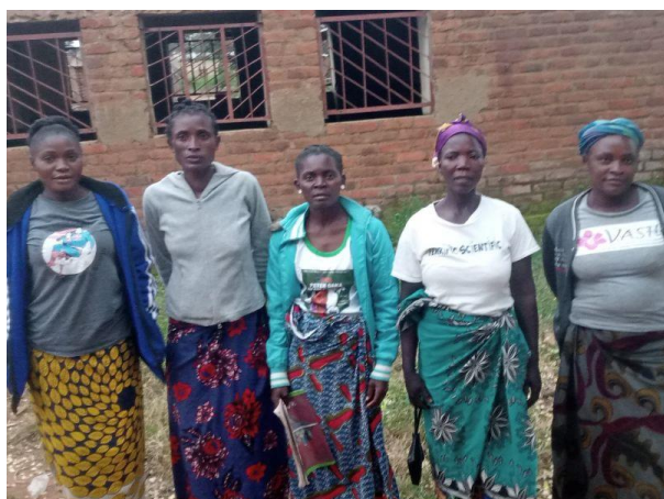
Chimphondwe 0206 Group for farming of groundnuts

Next time I plan to choose an entrepreneur and tell more of her story.