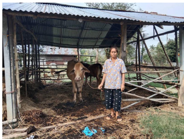
Nid from Thailand for her cattle farming