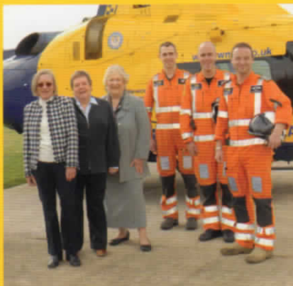
Trust members with WNAA crew

In a fabulous gesture, The Soroptimist International of Rugby Charitable Trust donates £100,000 to WNAA