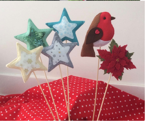
Hanging robins each robin has a space for a chocolate or small gift (not included) £5 each 7cm x 5cm