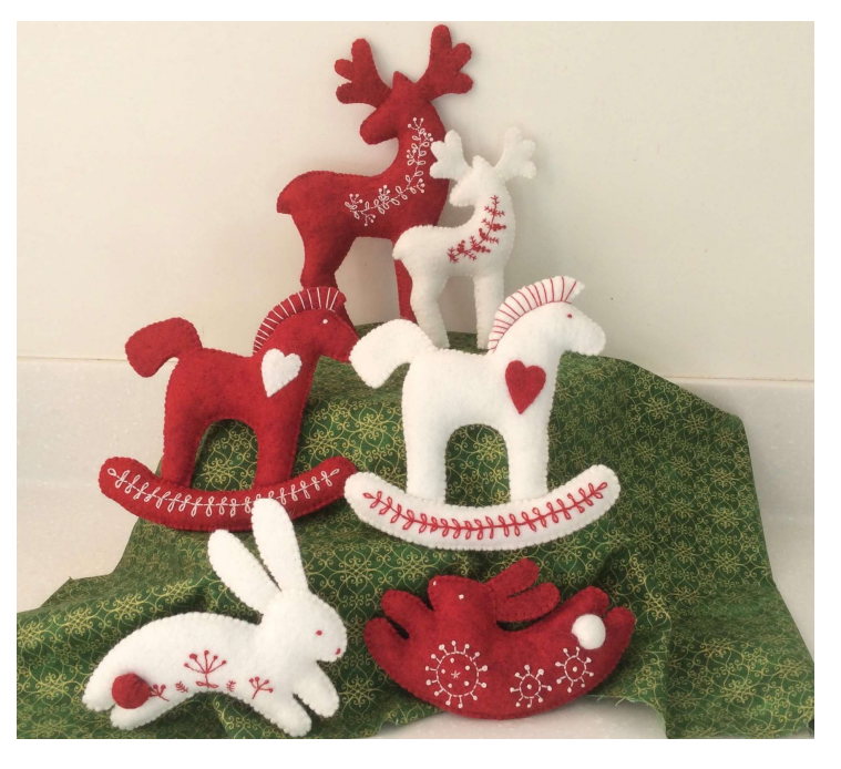
Small reindeer, rabbit or rocking horse - £5