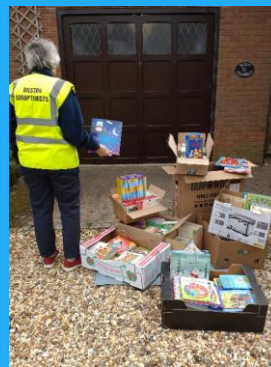
Books packed ready to be delivered.

The books came flooding in from many sources, members, friends, neighbours making a grand total of 1600 books. We are so pleased to be able to help those children who don't own even one book and hopefully they will be distributed to deprived children in Bilston Schools.