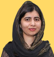
Malala Yousafzai , Girl's education activist

"Hundreds of millions of girls are out of school today. I want to see a world where every girl can access 12 years of free, safe, and quality education; where all girls can learn and lead."