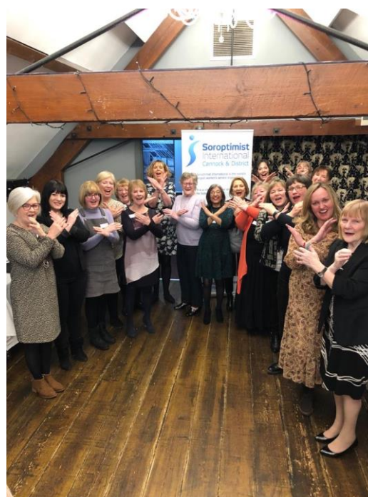
Pictured are members at the meeting adopting the Break the Bias pose

Discussion led to the formation of a working party to investigate any project we can put forward in the Cannock Chase area to help women feel safer.