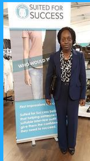
Before and after being kitted out with suitable interview clothing