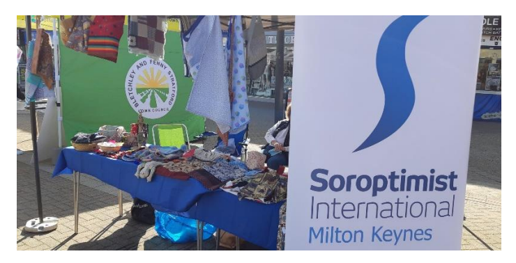
Well done our craft stall at Bletchley and Fenny Stratford Town Council Food and Craft Fayre – nearly £80 raised and the sun shined for us.

One of our members is looking into the possibility of obtaining sponsorship for our "Clean Start" Buckets, which would be great so let's keep our fingers crossed.