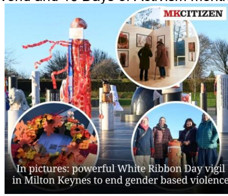
In pictures: powerful White Ribbon Day vigil in Milton Keynes to end gender based violence