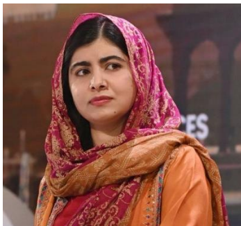
Malala Yousafzai – born 12 July 1997)

“If we want to achieve our goal, then let us empower ourselves with the weapon of knowledge and let us shield ourselves with unity and togetherness”