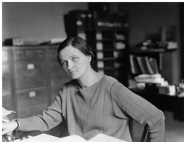
Cecilia Payne 1900 - 1979

A British-American astronomer and astrophysicist. In her 1925 thesis proposed that stars were composed primarily of hydrogen and helium. Her groundbreaking conclusion was initially rejected, because it contradicted the science of the time, which held that no significant elemental differences distinguished the Sun and Earth. Independent observations eventually proved she was correct. Her work was foundational to modern astrophysics. To learn more click here .