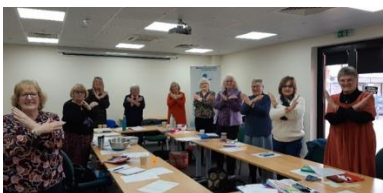
Our February Planning day and showing support for IWD 2022 campaign theme "BreaktheBias"