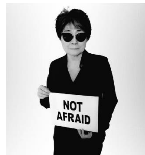
"Art is a way of survival" Yoko Ono

She told women watching events unfold in Cardiff Bay "you (women) need to know your potential is limitless". To learn more click here .