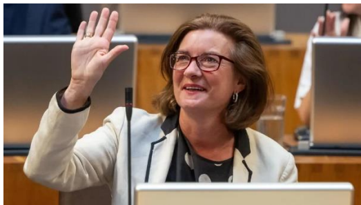
Eluned Morgan Wales first female first minister 2024)

On 6 August 2024 Eluned Morgans has been confirmed as the first female first minister of Wales.