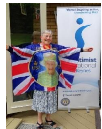
Getting into the spirit of our Platinum celebrations