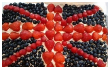
Wonderful food and a lovely day