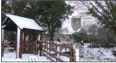
Bring & Share Buffet

Friday 15 th December 2023 7:00pm in St Thomas's Church Simpson, MK6 3AD