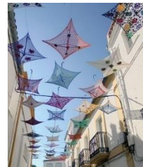
Gaucin, Andalusia, Spain. Crocheted umbrella street decorations which also create shade made by local women's groups

“There is a stubbornness about me that can never bear to be frightened at the will of others. My courage always rises at every attempt to intimidate me.”