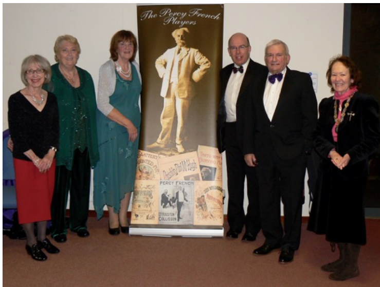
On the last meeting before Christmas club members were entertained by members of the Percy French Players