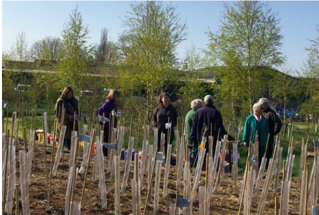
Soroptimists at work