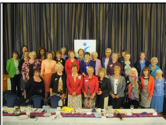
SI Perth members attending SI Scotland North meeting and SI EASTER ROSS'S 40th Anniversary Lunch

Taking on the role of President and being part of Team SI Perth is an honour."