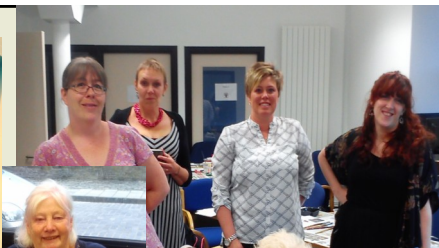
SMALLS FOR ALL—HANDING OVER BRAS AND PANTS OUTSIDE