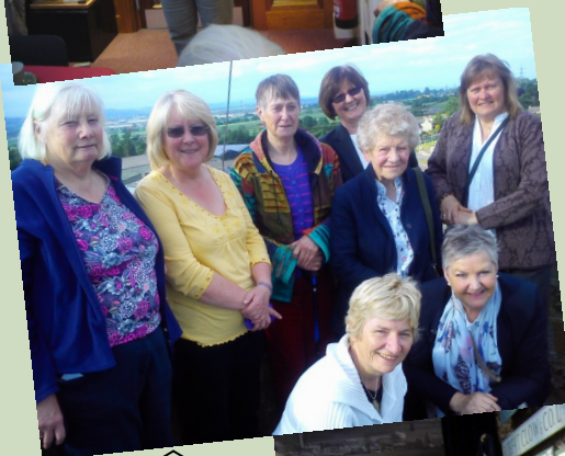
MEMBERS WHO CLIMBED TO THE TOP OF THE