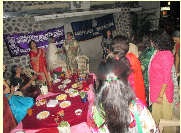
Members of SI Pune, one of our Friendship Links, at their Annual Charter