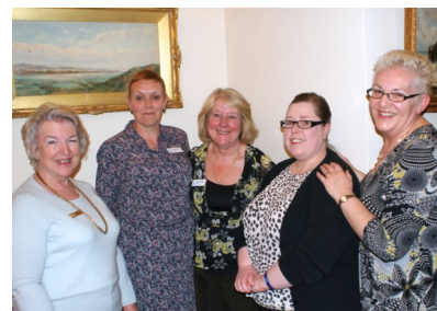
A warm welcome to our newest members