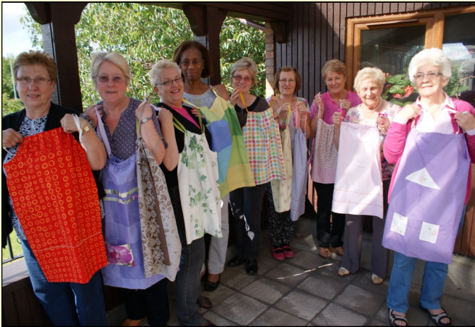
Pillowcase Dresses - See Page 3 for more pictures and

Disability Sports African Project Works Accept & Respect Campaign FGM— Female Genital Mutilation MDS—Modern Day Slavery & Trafficking OWLS—One Stop Women's Learning Service WOW—Windows on the World Collecting & Recycling Books Aloud