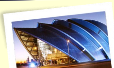
The Clyde Auditorium (Armadillo) at the SECC in Glasgow—venue for the Conference