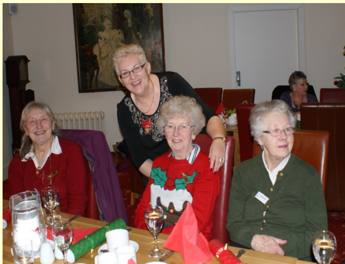
December Club Meeting Our Christmas Meal At the Royal George Hotel

Meals charity (we gave our leaflets and told people what the charity did) and will be donating the money raised to the charity. Mary's Meals are now feeding 1,035,637 of the world's poorest children every day they attend school. Their simple but effective approach has gathered momentum and today they serve children across Africa, Asia, the Caribbean and South America. They also support a home for young people with HIV who were abandoned as children in Romania.