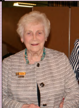
To be recognised with Honorary Life Membership