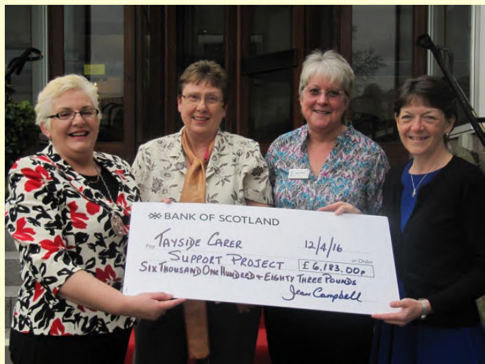
Presentation of cheque for £6,183 to Tayside Carers' Project.