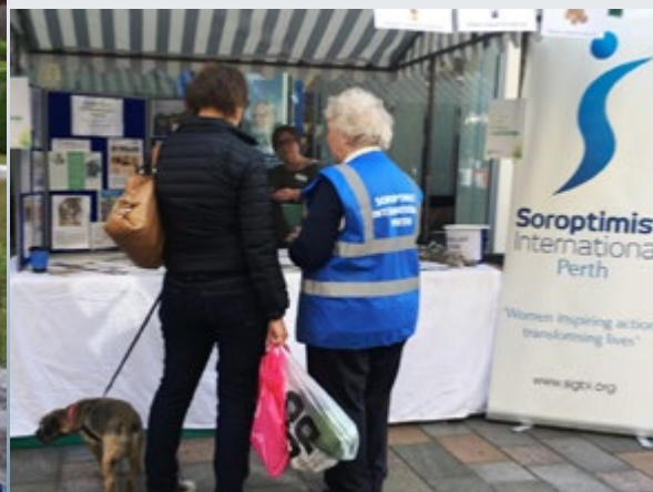
Perth Soroptimists staffed a stand to raise awareness of SI at the Rotary Charity Fayre held in August.

SIGBI FEDERATION CONFERENCE Liverpool - 25th to 28th October 2018