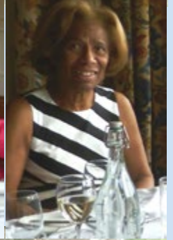
Perth members enjoy a get together lunch at Ballathie House Hotel, Perth.