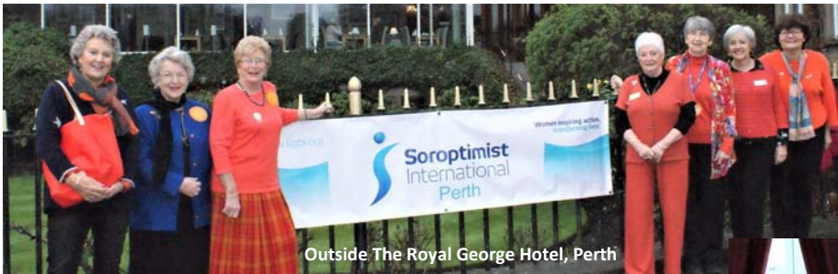
Outside The Royal George Hotel, Perth

November 2019 saw Perth club being the host to the Regional Council meeting where members wore orange to support the 16 days of activism and in particular "The Elimination of Violence against Women"