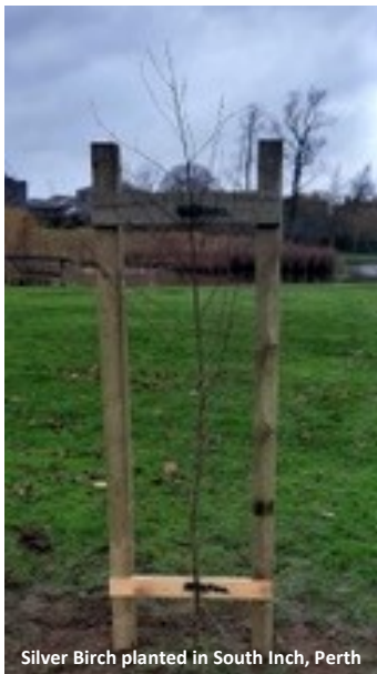
Silver Birch planted in South Inch, Perth