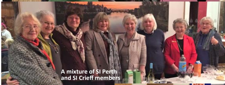
A mixture of SI Perth and SI Crieff members

One of our most enjoyable fund raisers is the local ROCK CHOIR who performed for us literally days before we were all forced into a national lockdown in March. This gathering turned out to be the last face to face meeting that we have had with our members. The Annual General Meeting due to be held in April was postponed until the 8th September. The club executive started having Zoom meetings from the beginning of June but it was August before we managed to organise