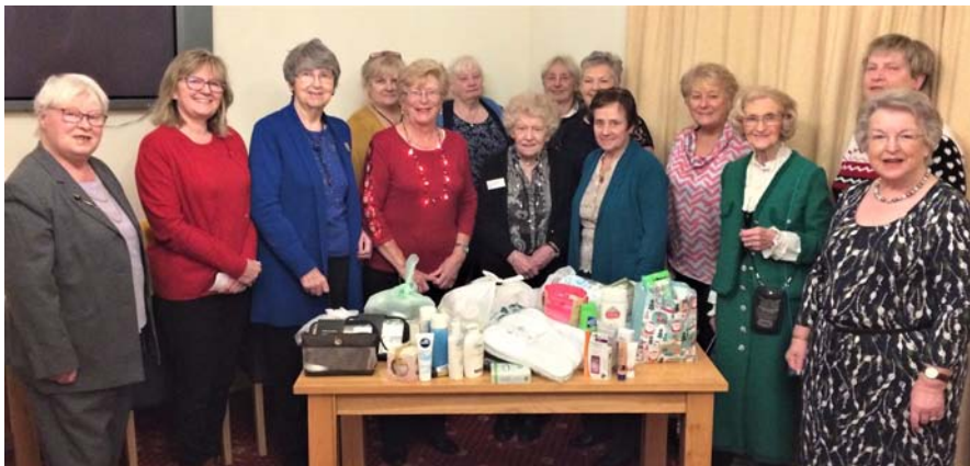
Collection of toiletries that have been collected by members for local Women's Aid