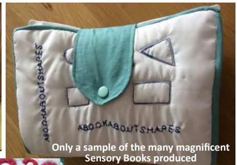
Only a sample of the many magnificent Sensory Books produced