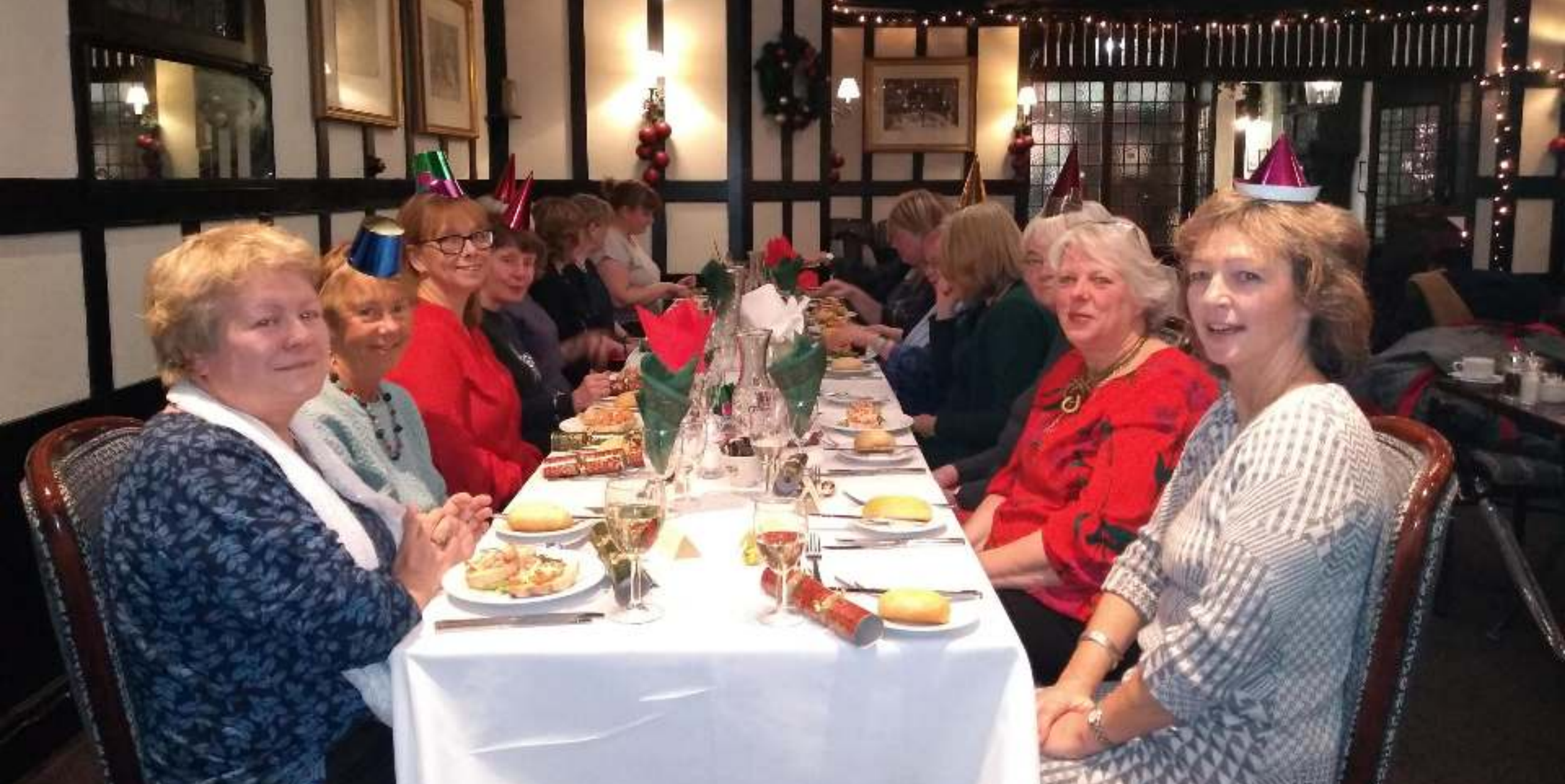
DECEMBER: We enjoyed each others company over a Christmas meal at the Red Lion.