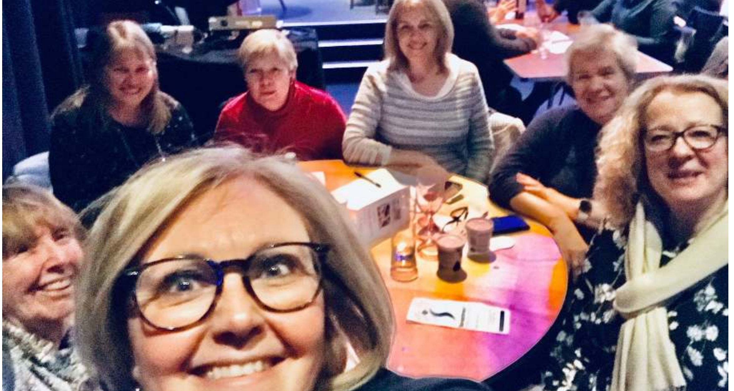
MARCH: We had fun at the Rotary club charity quiz night.