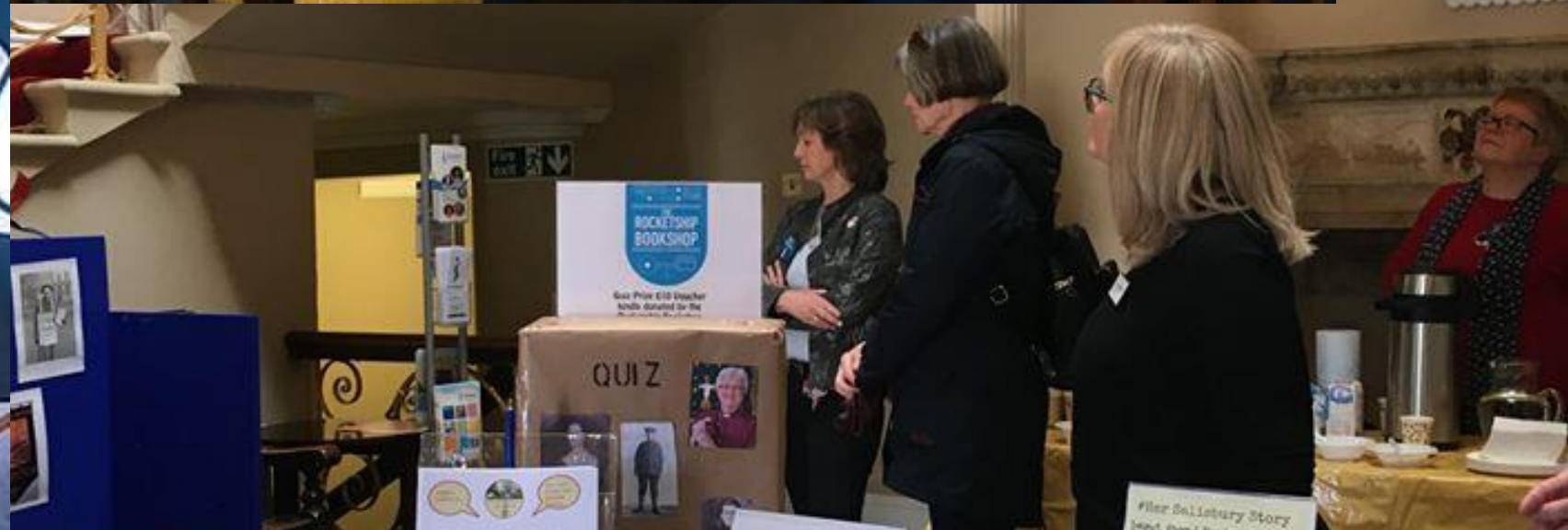
MARCH: The launch event took place at Salisbury Guildhall and featured speeches, guided walks, a quiz, workshops, and of course, lots of information about women from Salisbury's history.