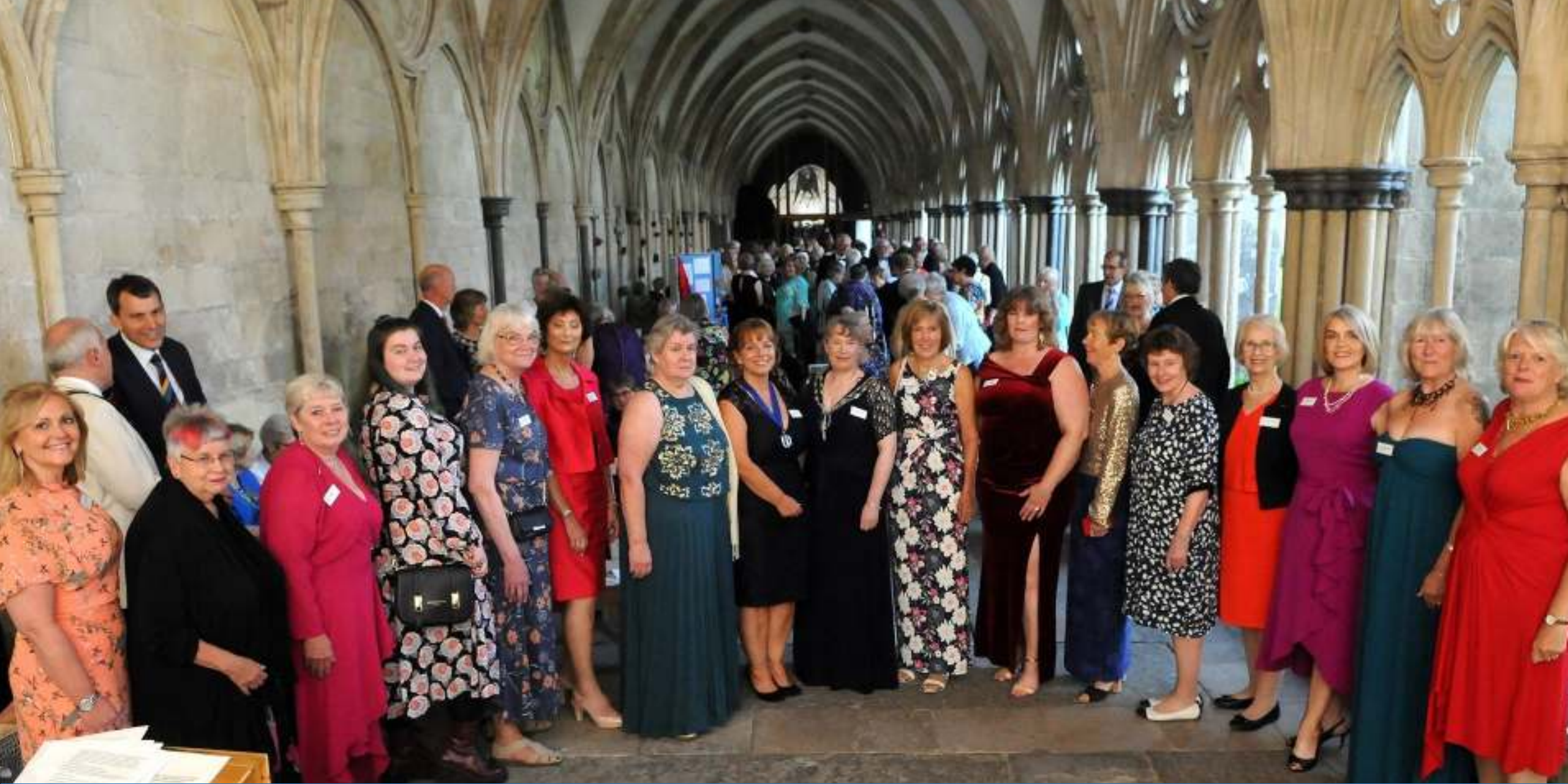
AUGUST: We were joined by friends, family, local dignitaries and Soroptimists from 23 other clubs to celebrate our charter as a new club – SI Salisbury!