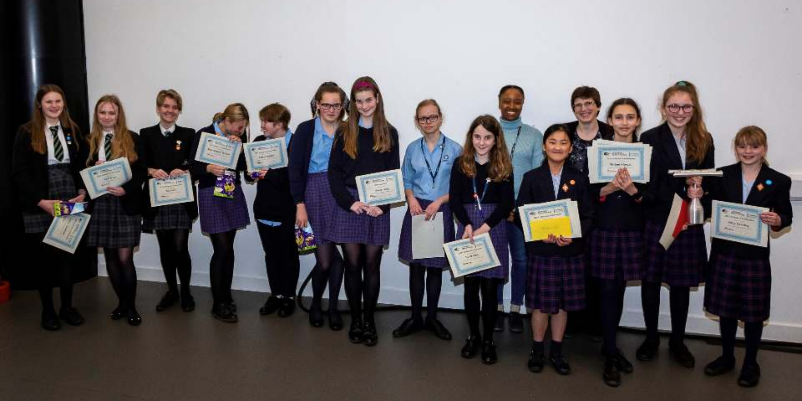
MARCH: All the girls were given CREST awards, and there were cash prizes for the winning girls and schools