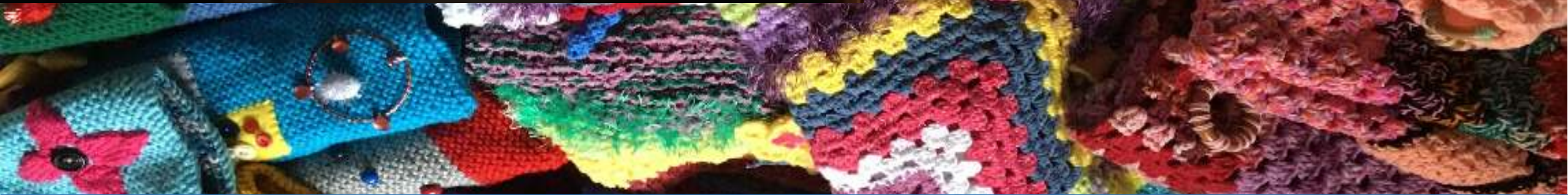
APRIL: We started making twiddlemuffs. By the end of the year, over 90 had been donated to local care homes and we set up ongoing supplies to local individuals