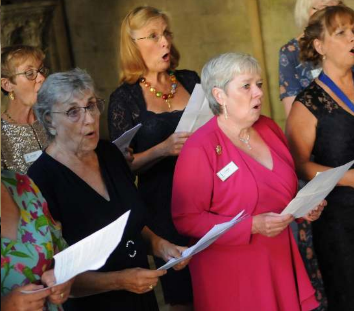
AUGUST: Formalities and Singing "21 st Century woman"