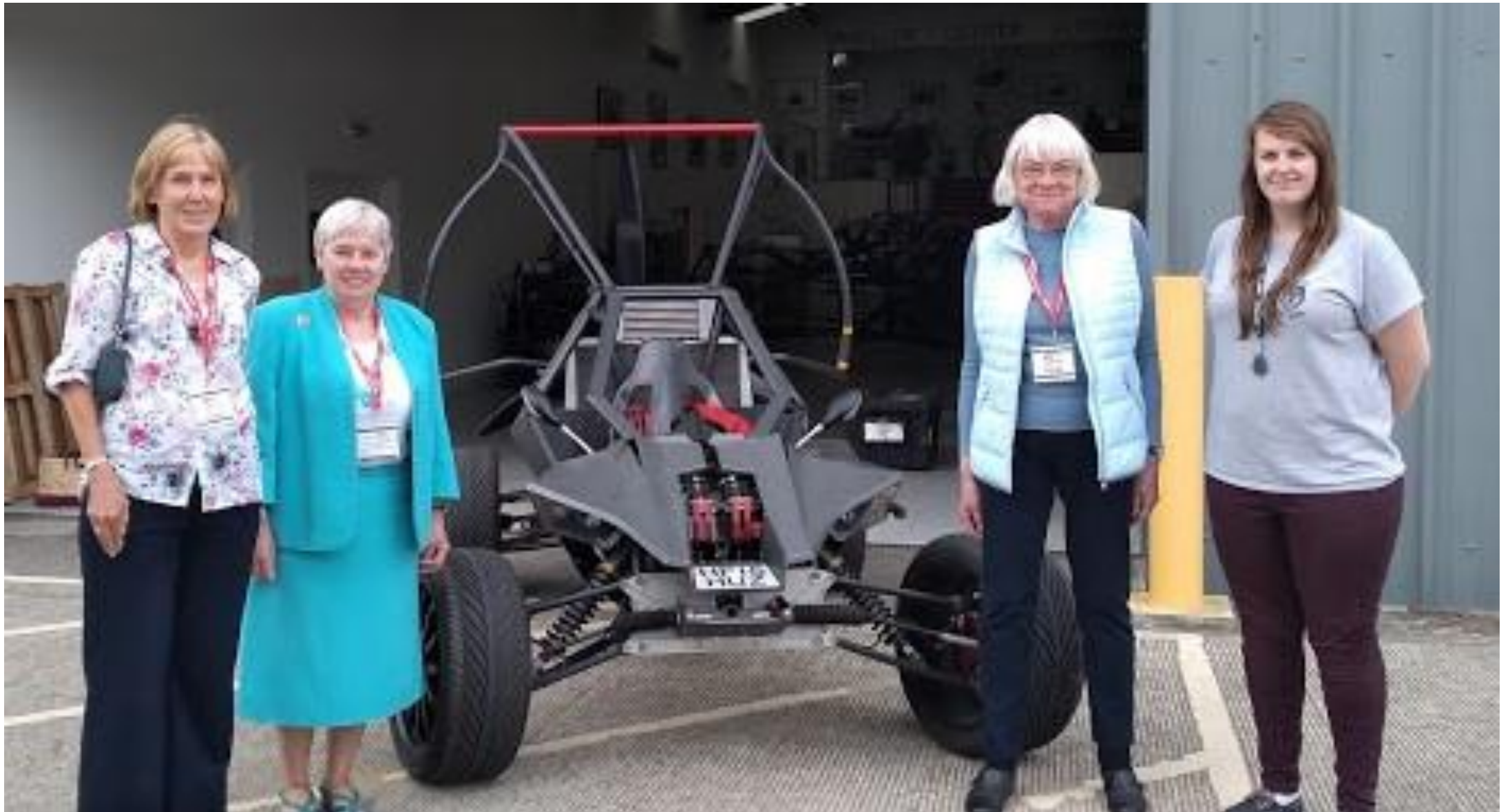
JULY: Some of our STEM challenge team visited the one of the event sponsors Gilo Industries