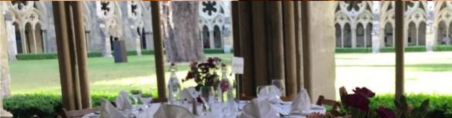
AUGUST: Our charter dinner in the Cloisters at Salisbury Cathedral