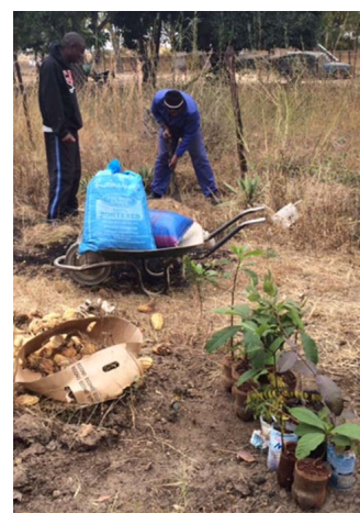
Donations of fruit trees from SIV being planted by the staff at Melfort Old Age Home. These are avocado trees.

SIV has given Hupenya Hutsva, the Government run boarding school, new mattresses for the beds. They then had the bright idea of contacting expensive private schools in Harare and asking them to clear out the shoes in their lost property cupboards. This allowed all but 30 children to have shoes for school and sports. The extra 30 were new arrivals and they will soon be kitted out via the same route.