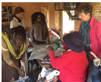
Teaching the Melfort resident's how to make rag rugs

the Emerald Hill Orphanage. SIV provide the catering for the exhibition and they are hoping to use the monies raised to pay for a scholarship for a poor girl who would otherwise have to leave school.