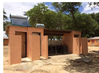
SIV installed solar panels in one of the staff houses and in the residents' bathrooms

eventually they will be able to sell their rugs by the roadside to give the women a small income. The chicken farm which SIV set up at Melfort a couple of years ago is still flourishing and supplements the residents' diet.