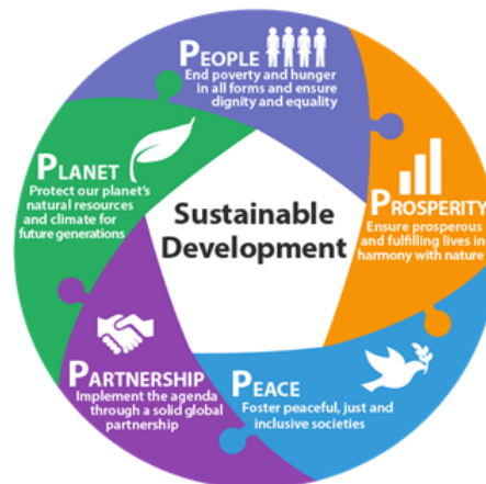
Table of the 5Ps and the related SDGs

People; Prosperity; Peace; Partnership; Planet.