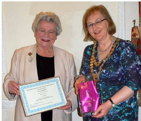
totaling 224 years. We congratulate and appreciate them all!

Other members were presented with long service certificates with their combined service