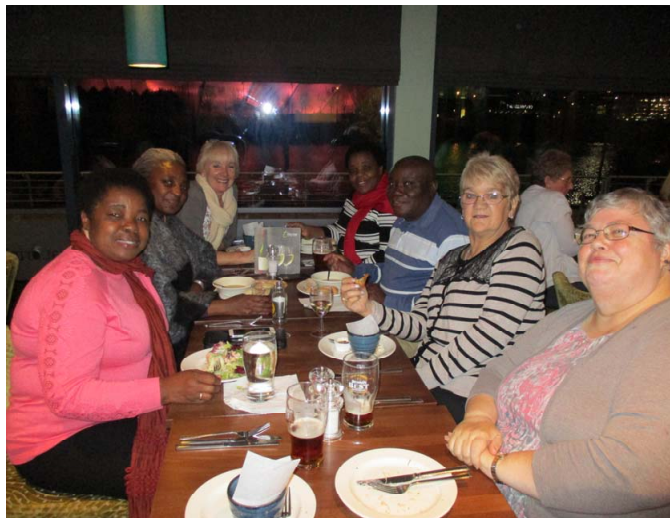
Soroptimists from SI Harare, SI Vabatsiri and SI Uyanda (plus husband) having dinner with Yorkshire Soroptimists at the SIGBI Conference in Glasgow.

Some time ago SI Uyanda adopted the children's cancer ward at Parirenyatwa Hospital in Harare. They have decorated and refurbished the ward and staff room and they regularly provide medical equipment as needed plus heaters and toys. The latter are regularly stolen so their replacement is an ongoing task. The heaters are particularly important for malnourished patients. SI Uyanda is also running its 'Live