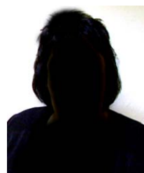
Public Relations Officer- COULD THIS BE YOU ?