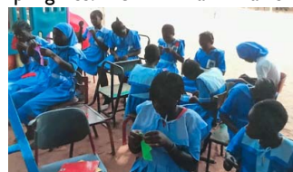
photo shows sewing in progress. Richmond and Dales

presented each girl with a Certificate of Appreciation and are very proud of these young women and their commitment to improving the lives of women and girls at home and abroad.