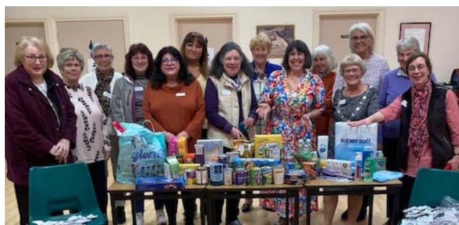
Club members are looking forward to launching a monthly Friendship Cafe at the Newby and Scalby Community Hub in June.

Donations of goods and cheques were made to Westway Open Arms Food Bank, Ryedale Food Bank in Malton and EVA Women's Aid. Trees have been planted to support 'Plant a Tree for the Jubilee'. Blister Packs collected for Superdrug's Recycling Scheme and stamps for various charities.