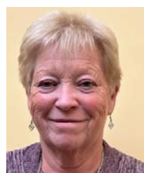
Joint Membership Officers