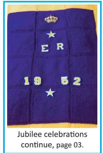
Jubilee celebrations continue, page 03.