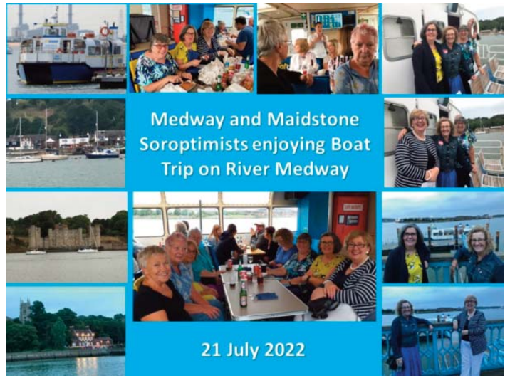
Medway and Maidstone Soroptimists enjoying Boat Trip on River Medway