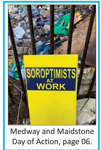
Medway and Maidstone Day of Action, page 06.