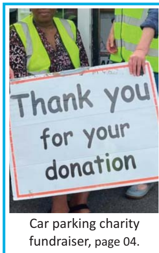
Car parking charity fundraiser, page 04.