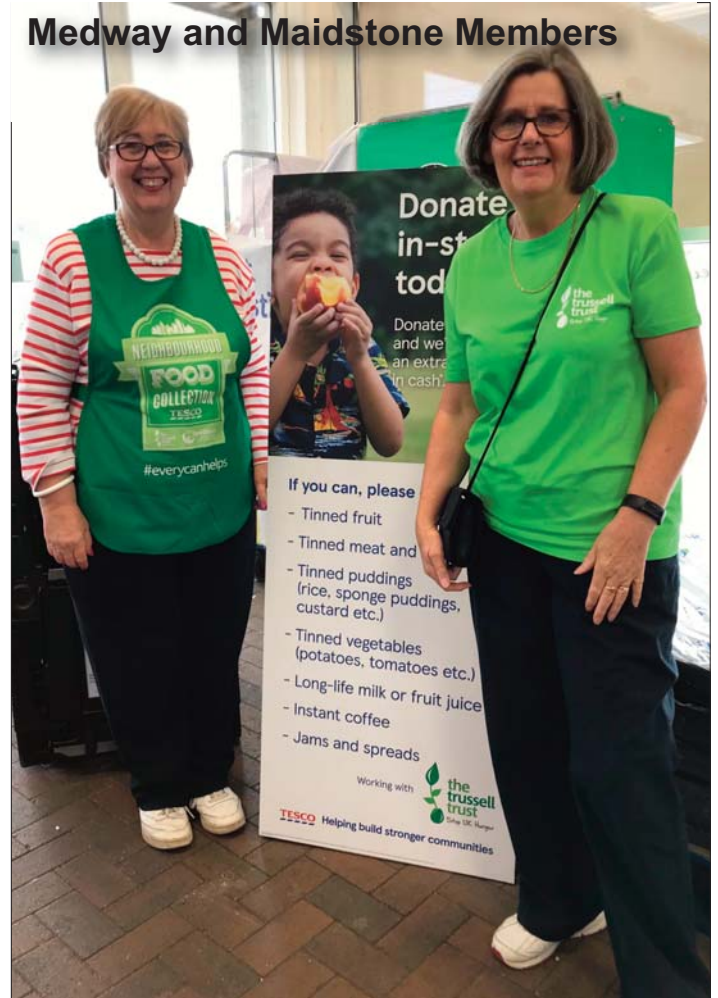
Medway and Maidstone Members

MEDWAY AND MAIDSTONE Soroptimists were contacted by Medway Foodbank on May 16 as they were looking for volunteers to help with the summer food collection. This was being held from Thursday, June 30 to Saturday, July 02 at Tesco Gillingham and Tesco Strood stores.