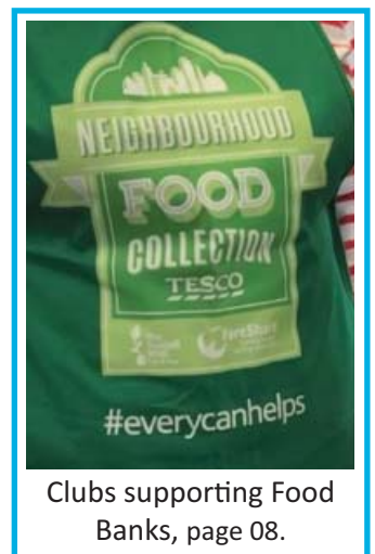
Clubs supporting Food Banks, page 08.