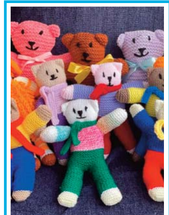
Trauma Bears spread their wings, page 04.