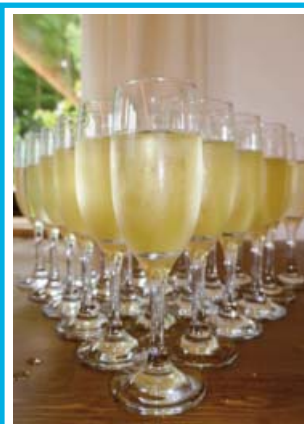
A right royal celebration in Bromley, page 05.