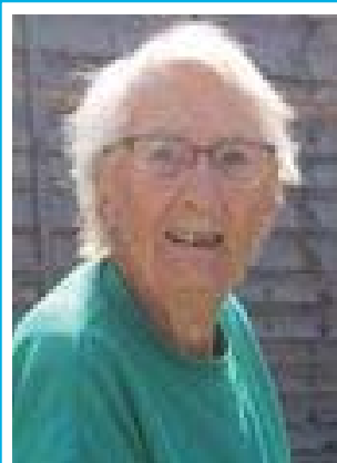
Farewell to Winn, page 02.