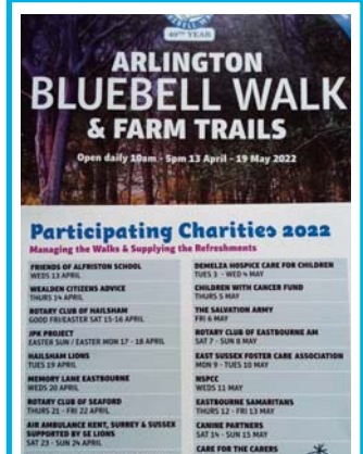
Supporting Care for the Carers, page 02.