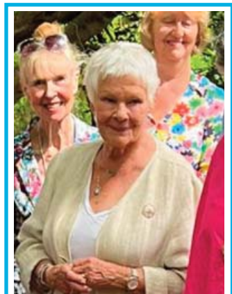
Planting roses with Dame Judi Dench, Page 07.