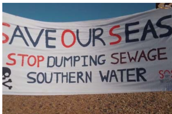
Canterbury Club support SOS Whitstable, page 02