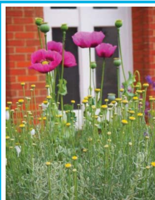
Excitement for the Sevenoaks' Club gardening team, page 04