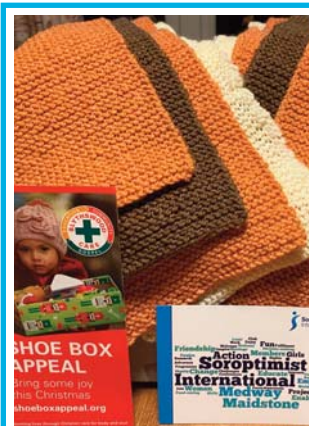
Soroptimists respond to call for knitters, page 04.