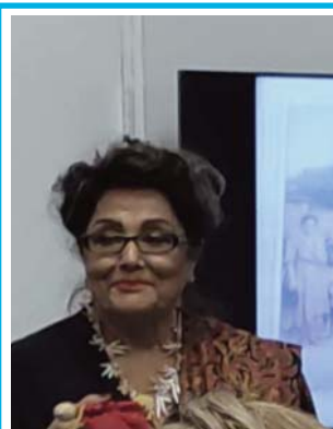
Educate a woman and you educate a family, page 02