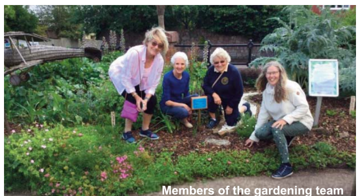
Members of the gardening team